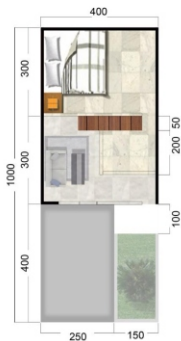
2 SECOND FLOOR