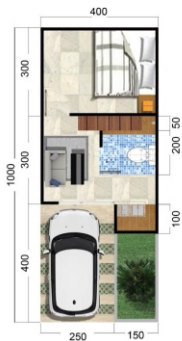
1 FIRST FLOOR